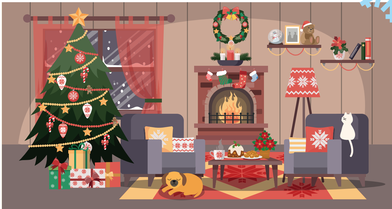
Answers: Wrapping paper, tinsel, poinsettia, Christmas tree, Christmas lights, Christmas pudding and mince pies, candles, decorations on the Christmas tree and cold weather.

Circle the items in the picture that could be dangerous for our pets at Christmas.